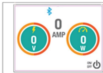
When switch off main unit

When the ON/OFF button on the bottom right corner of the screen is pressed, the main unit will shut off (to grey colour), and the LCD screen will indicate that there is no input and output. See below: